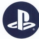
PSN Online Account

Disclaimer: This resource/information is not intended to encourage social media use and we cannot accept any responsibility for pupils that sign up to social media sites after using this resource/information.