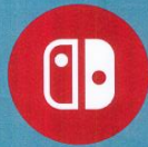
Nintendo Online Account