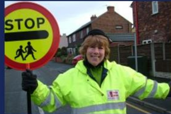
School crossing patrol