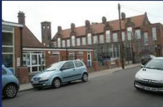
Adults in a school